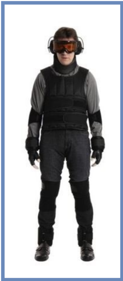
The Age Simulation Suit

Although not everyone living with a dementia diagnosis, or every family carer are elderly. We do know that there are a large number of elderly people living either with a diagnosis or caring for a family member.